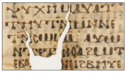
Figure 1: Excerpt from a papyrus letter by Besa, Abbot of the White Monastery in the 5th century, showing text without spaces and a lacuna.

loan word \psyche' is visible at the top left). Manuscript damage, also shown in the figure, represents a frequent challenge to annotation efforts (see Section 7).